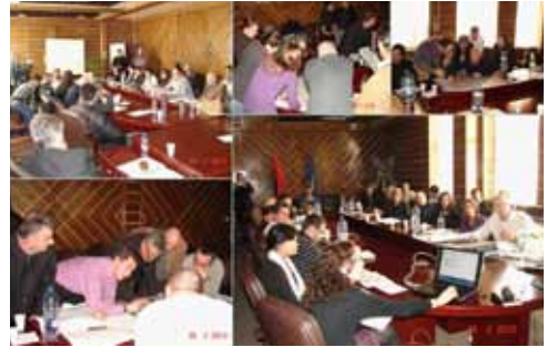
Some pictures of the public events

and urban design requirements which the project has to fulfil. The workshops served also as information sharing and capacity building events.